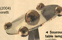
◀ Soucoupe table lamp (c1978) designed by Yonel Lebovici at Galerie Chastel-Maréchal