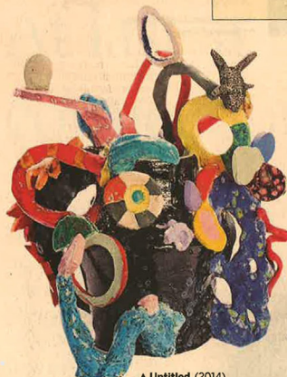
▲ Untitled (2014) designed by Milena Muzzquiz at Salon 94