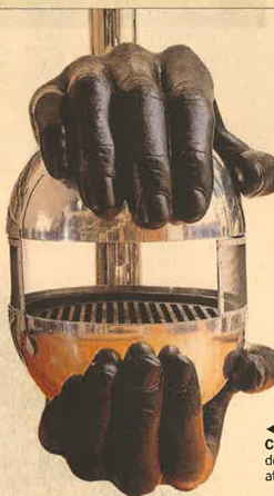
◀ Fireplace 'Les Mains Chaudes' (1979) designed by Yonel Lebovici at Galerie Chastel-Maréchal